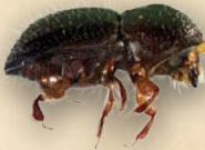
Invasive shot hole borers