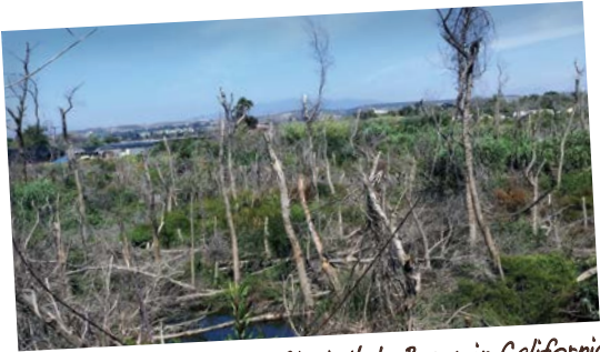
Trees killed by Invasive Shot Hole Borer in California.

Prevention is key – don't move firewood when traveling and don't bring it back home from a trip.